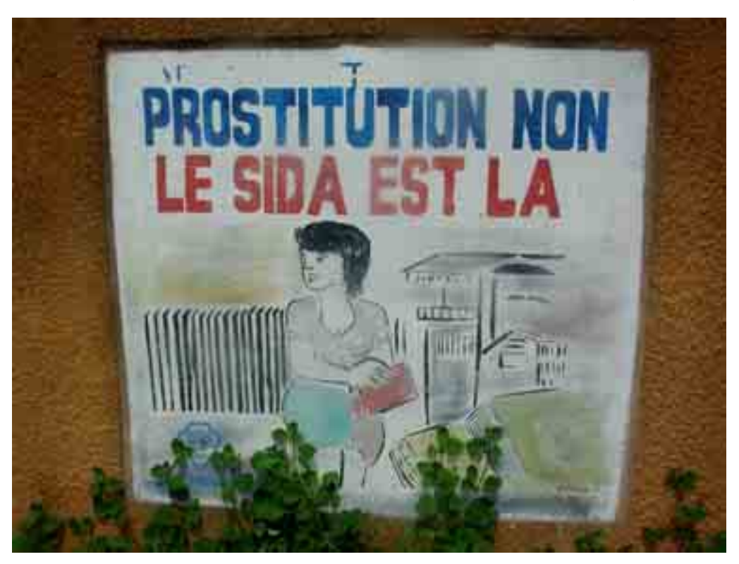
Anti AIDS campaign in Bouake, the rebel-held main city in the centre of Cote d'Ivoire, 2004.

Serious attention and resources and genuine political will are required to implement anti-trafficking measures. Mere ratification of anti-trafficking conventions by major source countries of trafficking in order to appease donors, without effective implementation, is a fruitless exercise. Source countries should be fully integrated in preventive efforts, both at governmental level and through civil society. In countries of destination, demand for