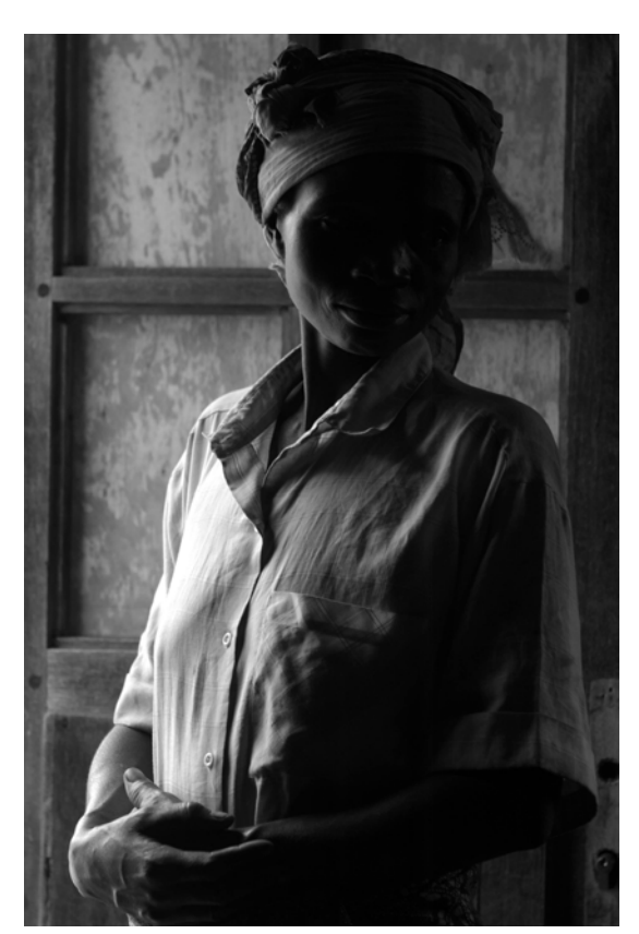
When one was finished the next would start. Democratic Republic of the Congo.

Survivors of sexual violence may experience severe, ongoing physical injuries. The nature of physical injury after sexual torture (such as cutting off breasts) is an ever present, horrific reminder of the rape. Some of the most frequent psychological symptoms are anxiety, sleep disorders, nightmares, apathy, loss of self-confidence, depression and, in more severe