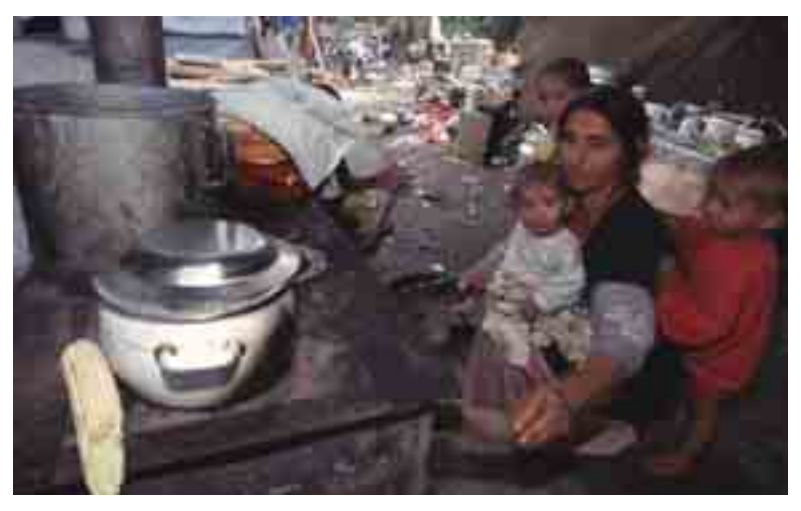
A displaced Roma family from Kosovo living, like many others, under difficult conditions where food is scarce and rationed.

UNHCR has a Policy on Refugee Women, Guidelines on the Protection of Refugee Women and Guidelines for the Prevention of and Response to Sexual and Gender-Based Violence against Refugees, and Internally Displaced Returnees Persons, and continues to improve gender (and age) mainstreaming in its assistance protection activities. Of importance is involving refugee women in all decisions that affect their lives: participation promotes protection. Refugee and displaced women have a strong voice the international community must learn to listen.