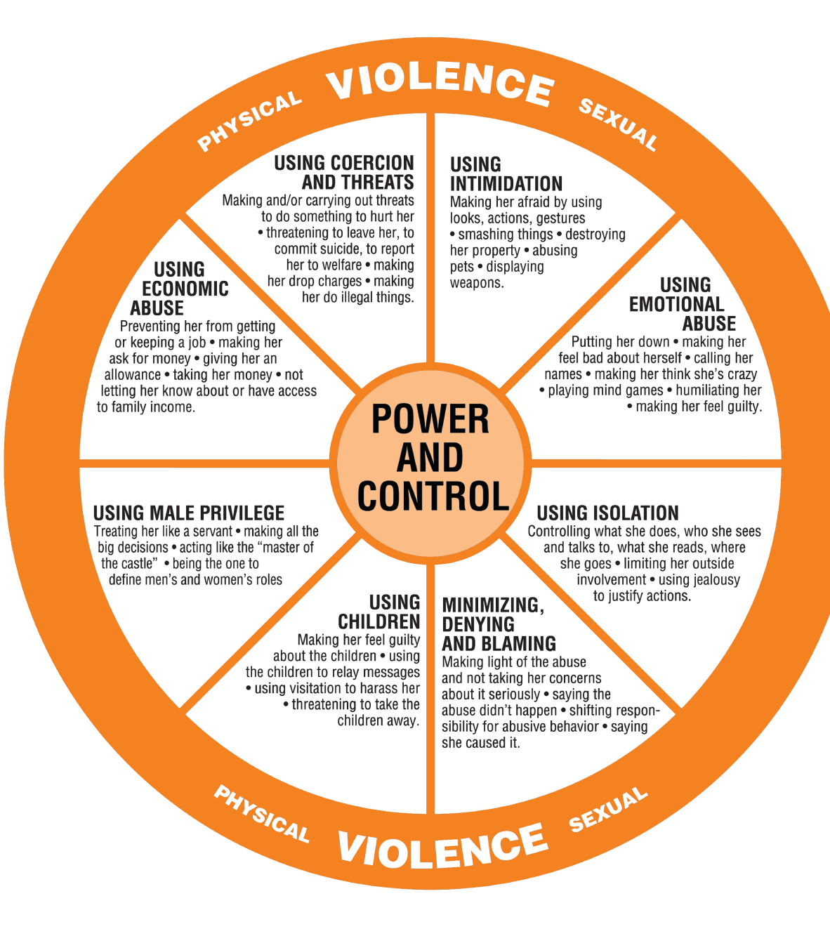
Figure 1: The Power and Control Wheel