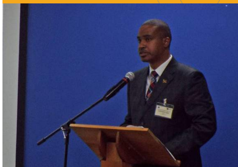
Representative of Jamaica

Jamaica | The Manager of Security and Standards in the Ministry of National Security of Jamaica discussed that government regulatory efforts must keep pace with the industries' evolution rate across the region. In Jamaica alone, the industry is growing rapidly; at the same time, the current legislation is 25 years old. The representative shared that the government is currently