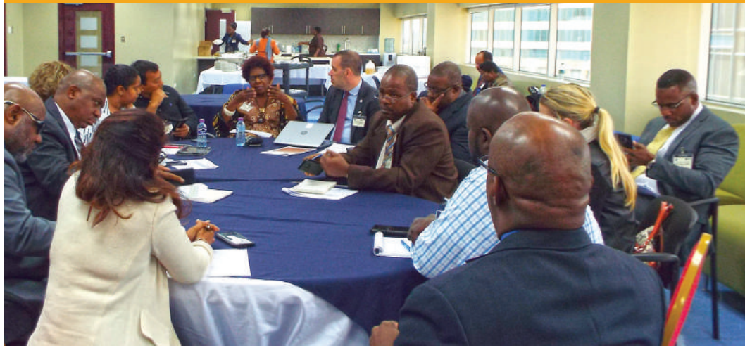
Participants in a breakout group session

control in the private security industry. Subsequently, the UNLIREC Senior Policy Adviser presented key challenges around SALW in the Caribbean: 19