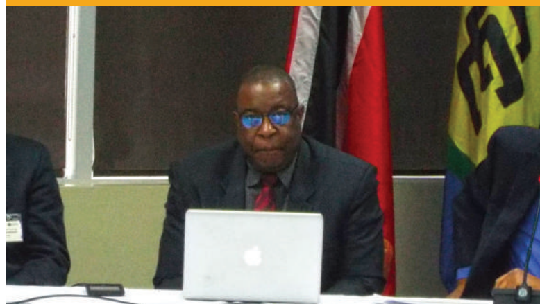
Ansley Garrick, Assistant Commissioner of Police of Trinidad and Tobago

During the discussion, a participant noted that both gender and labour rights are reflected in the Montreux Document and expressed that indeed gender and labour rights are human rights that have their basis in international law. Participants also engaged on the issue of gender mainstreaming in the labour force of PSCs; one participant raised that some clients prefer male PSC personnel and for several positions, women simply do not apply. The panelists discussed that gender equality before and during recruitment forms the basis for having a more representative work force. PSCs should also ensure gender-safety workplace policies including maternity and health leave to ensure that the concerns of workers are taken to account. In reaction to the presentation by IEPADES, a number of participants agreed with the point that legislation is a first step but mechanisms are then required to ensure that the relevant legislation is implemented and enforced. Especially in situations with large transnational extractive clients of PSCs where the economy relies on this revenue significantly, one participant expressed that ensuring legislation is implemented is crucial to enable the enforcement of quality standards. One participant requested practical recommendations on raising awareness of community-based levers of