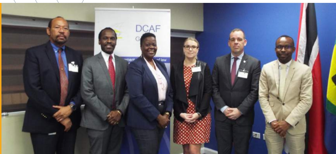
Closing panel, from left to right: