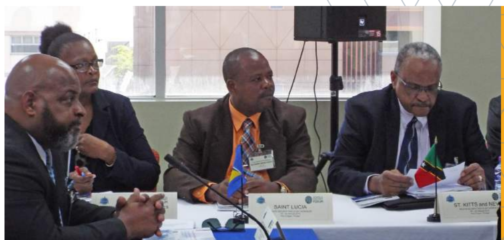
Representative of Saint Lucia and St. Kitts and Nevis

Most CARICOM Member States have some form of private security regulation, however, there is a need to update legal and policy frameworks, as well as regulatory, oversight and governance mechanisms. Several States have developed new policies or started policy processes but have not yet implemented them. 9 National regulations also differ throughout the region; legislation is seldom harmonised across CARICOM despite the transnational nature of the clients of the PSC industry. Diverging regulations complicate the integration of the private security industry into the Caribbean Single Market and Economy. This presents a further issue, since combatting crime transcends borders; the activities of organised crime groups often cross borders frequently. 10 Where PSCs are armed, further problems can arise such as the proliferation and control of guns. Increasingly, employees of PSCs are implicated in criminal activities including armed assault.