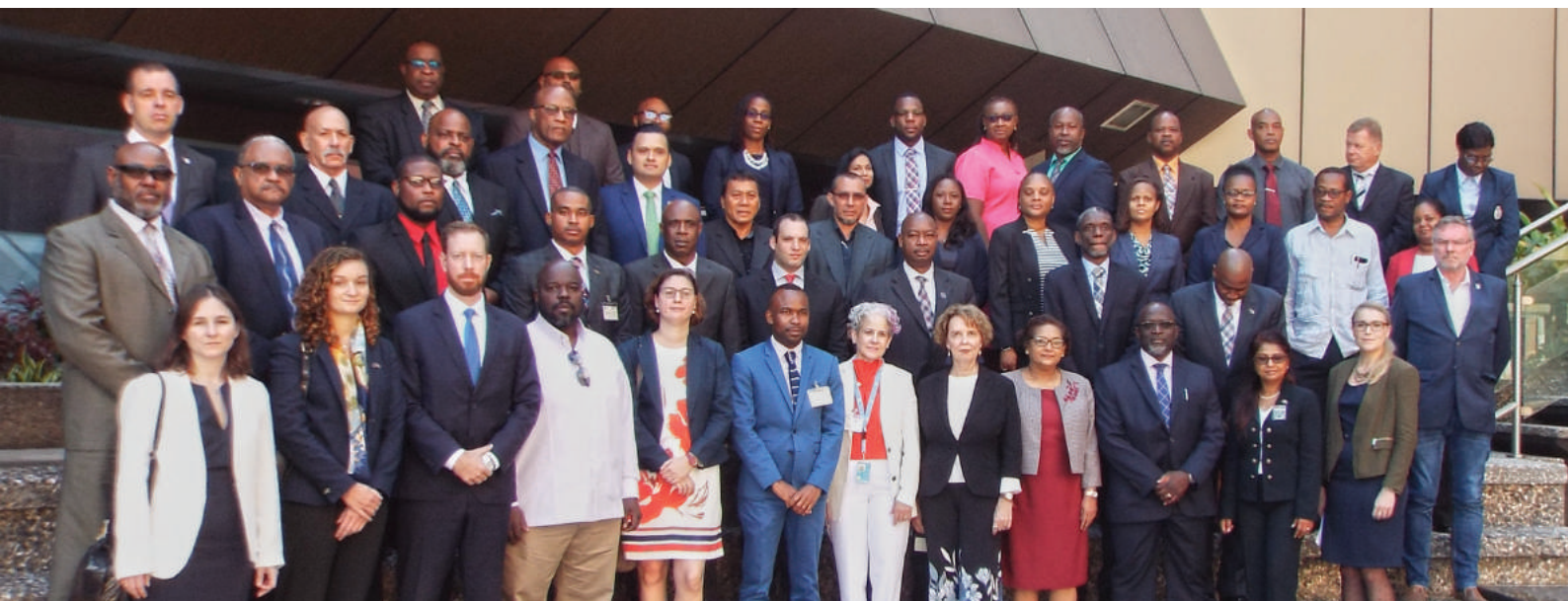
Participants of the Multi-stakeholder Workshop

On 4-5 February 2019, over 75 representatives of governments, Montreux Document participants, International and Regional Organisations and institutions civil society organisations; private security companies; and industry associations representatives gathered in Port of Spain, Trinidad and Tobago, to discuss regulation, oversight and governance of the private security industry in the Caribbean Region.