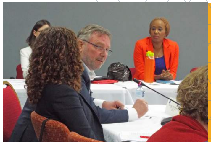
Representative of Uni-Global Union

Finally, the Head of Department of UNI-GLOBAL Union, introduced his organisation which represents one million PSC personnel members in 60 countries. The representative discussed the role that UNI-GLOBAL plays in protecting labour rights, including freedom of