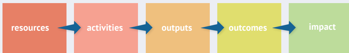
Box 21: The chain of results (simplified representation)

Developing the chain of results assumes that stakeholders in the SSR programme agree on the results and changes to be monitored and evaluated throughout its implementation.