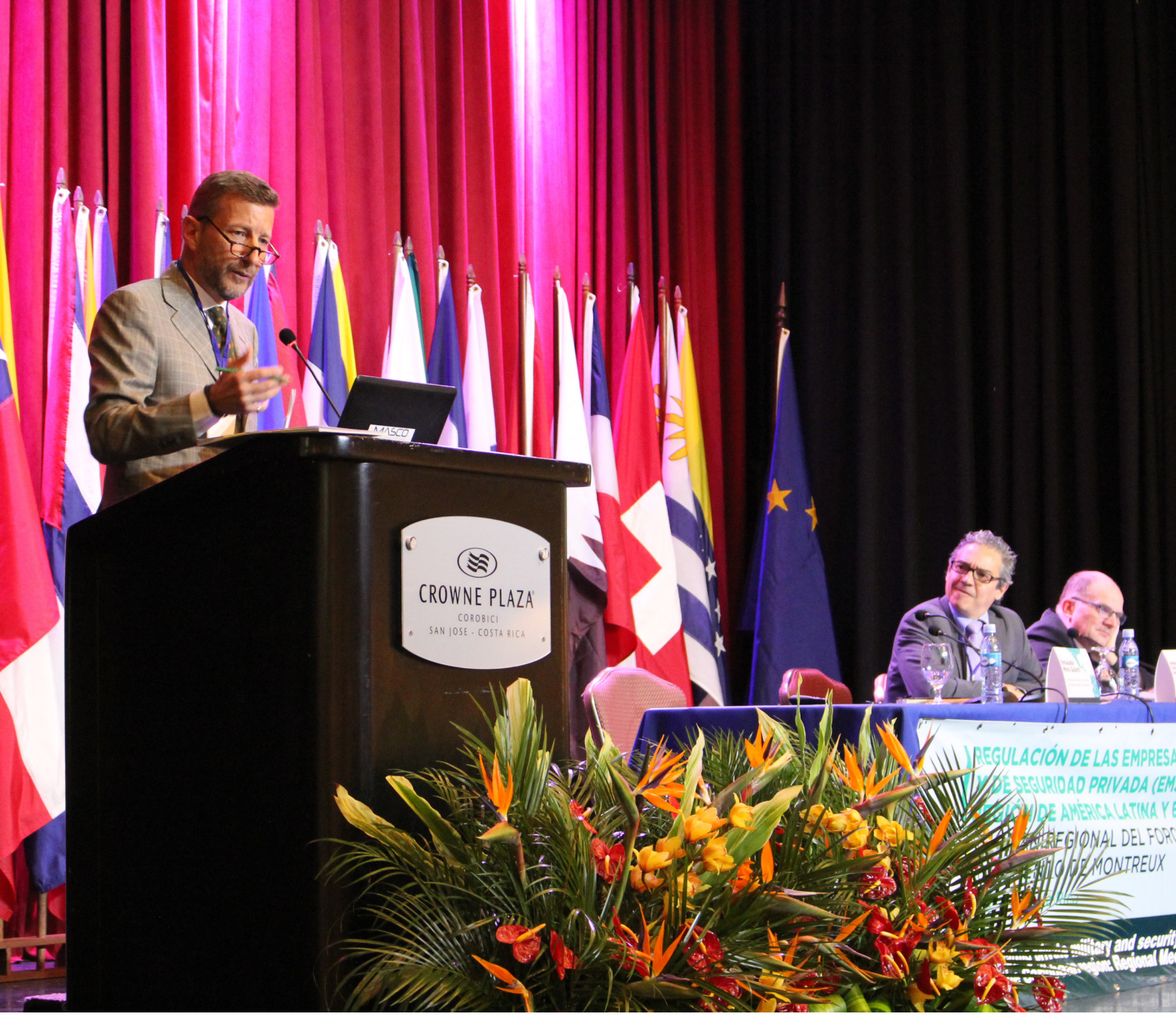
Ambassador Mirko Giulietti, Swiss Federal Department of Foreign Affairs (FDFA)