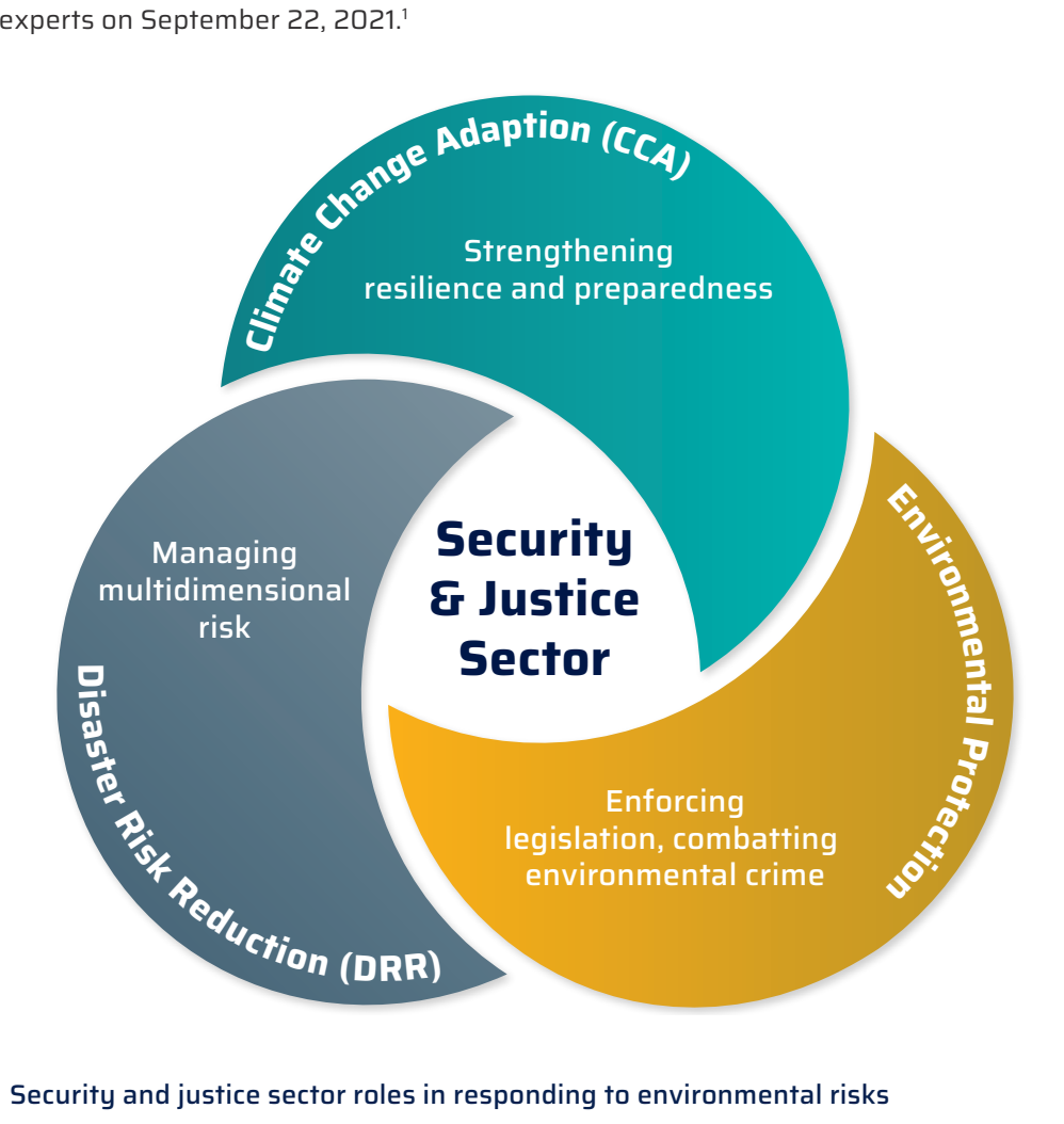
Figure 1: Security and justice sector roles in responding to environmental risks

Climate change and environmental degradation are impacting human security - whether through natural disasters of increasing frequency and severity, the potential of resource scarcity to exacerbate existing tensions and create new conflict dynamics, or long-term effects such as forced migration. A key question for governments and communities alike is: what might actually make us more secure in an era shaped by climate change? And what role can the security and justice sectors play, not only in responding to climate-induced crises but also in tackling the factors driving climate change to begin with? These are the questions which guided DCAF's conversation with a panel of environmental and security experts on September 22, 2021.1