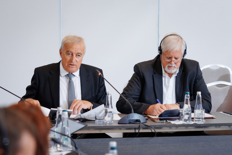
Conference on judicial control in carrying out special investigative and counterintelligence measures, 23 May 2025, Chisinau

On 12 June 2025, DCAF co-organised a joint judicial training with the National Institute of Justice on the “ investigation and prosecution of offenses against public authority and national security ”. Featuring both theoretical sessions and practical discussion-based exercises, the training aimed to enhance the ability of justice sector professionals to interpret and apply national and European legal standards in cases involving threats to public authority and national security in Moldova. DCAF brought in guest experts from Slovenia and North Macedonia, to complement the Moldovan trainers whose backgrounds sit in the general prosecutor’s office and the security and intelligence service. During the training, the participants analysed the distinctions between special investigative techniques and counter-intelligence measures, learned about applicable procedural safeguards, and reflected on the critical role of the judiciary in protecting fundamental rights in national security contexts.