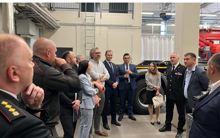
Moldovan delegation study trip on security sector governance and crisis management, 24-31 May 2025, Tallinn, Estonia

touched upon the topics of national resilience, of risk preparedness, of security policy coordination and inter-institutional coordination , as well as the digitalisation of processes . The study trip was organised at an especially timely moment, as on one hand, the supreme security council secretariat, following the development of the new national security law, is working on refining its mandate and strategic priorities, while on another hand, following the development of a new crisis management law, Moldova is re-structuring its crisis management system.