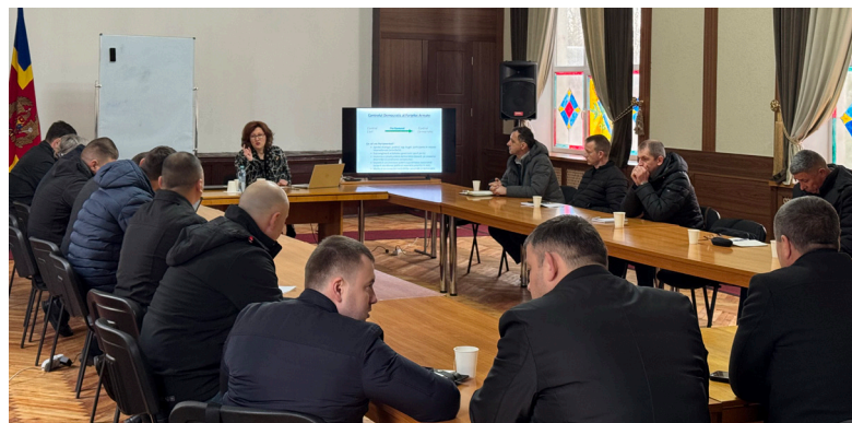
Seminar for Military Academy on security sector governance, 10 April 2025, Chisinau

developed by the DCAF project team, was part of a three-month tailored training programme on security sector administration and coordination organised by the academy.