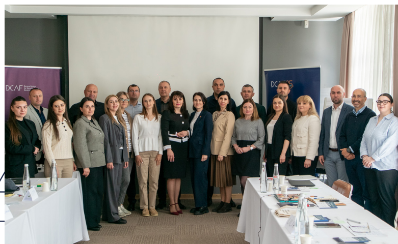
Second generation training-of-trainers sessions on integrity and gender themes, 13-21 May 2025, Chisinau

DCAF has continued to work on expanding the pool of integrity and gender trainers, and their reach, to contribute to integrity building within the MIA. In this period, DCAF supported several integrity and gender trainers engaged with the training-of-trainers (ToT) from previous project years to deliver trainings to different groups in the MIA.