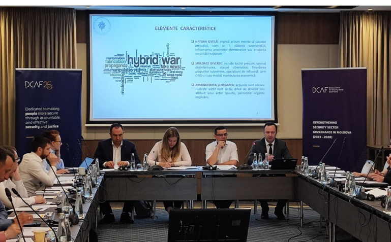
Training on investigation and prosecution of offenses against public authority and national security, 12 June 2025, Chisinau

On 12 June 2025, DCAF co-organised a joint judicial training with the National Institute of Justice on the “ investigation and prosecution of offenses against public authority and national security ”. Featuring both theoretical sessions and practical discussion-based exercises, the training aimed to enhance the ability of justice sector professionals to interpret and apply national and European legal standards in cases involving threats to public authority and national security in Moldova. DCAF brought in guest experts from Slovenia and North Macedonia, to complement the Moldovan trainers whose backgrounds sit in the general prosecutor’s office and the security and intelligence service. During the training, the participants analysed the distinctions between special investigative techniques and counter-intelligence measures, learned about applicable procedural safeguards, and reflected on the critical role of the judiciary in protecting fundamental rights in national security contexts.