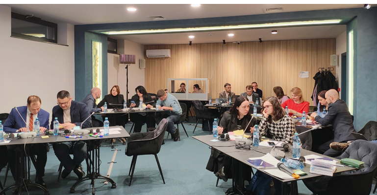
Workshop on strengthening civil society resilience in Moldova, 21 February 2025, Chisinau

On 22 May 2025, DCAF organised a second edition to its 'Discussion Club' for civil society members , started in December of last year. The participants, composed of several authors of the Independent Report on Security Sector Governance in Moldova, coordinated and edited by DCAF and PISA throughout 2023-2024, and other civil society organisations representatives, exchanged views on institutional coordination, and current issues and recent developments in the Moldovan security sector governance. The discussion focused on the draft national security law, under preparation, as it went on to review and adoption by the parliament.