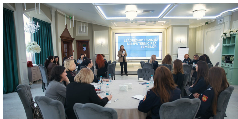
Workshop on leadership for gender equality and women's empowerment, MIA, 30-31 January 2025, Chisinau

From 30-31 January, DCAF organised a workshop on Leadership for Gender Equality and Women's Empowerment for 25 mid-level representatives of the MIA. The group included members of the MIA Secretariat in charge of coordinating the implementation of Moldova's National programme on Women, Peace, and Security as well as gender focal points engaged on implementing the same programme. The workshop facilitated communication and collaboration between the gender focal points and introduced useful leadership principles for women in the security sector working on National programme implementation.