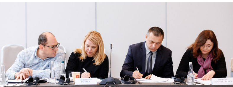
Multi-stakeholder debate forum on security sector governance in Moldova, 28 January 2025, Chisinau

On 28 January 2025, the project held its first multi-stakeholder roundtable of the year, by organising a security sector governance debate forum , in partnership with the Supreme Security Council Secretariat. The forum gathered representatives from state institutions, including the Supreme Security Council Secretariat, the parliamentary committee on national security, defense, and public order, the Ministry of Internal Affairs, the Ministry of Defense, the Security and Intelligence Service, representatives from civil society organisations, academia, as well as international partners, to review the state of legislative reforms and the 2025 priorities. The debate focused on the status of implementation of the national security strategy adopted in 2023, and the development of the draft national security