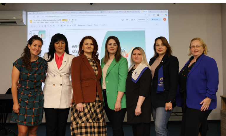
Workshop on benchmarking and partnerships with the Women's Police Association, 23 May 2025, Chisinau