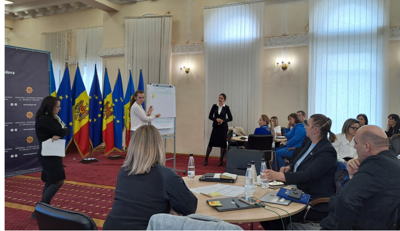
Presentation of portfolio management software for project management, MIA, Chisinau

Between January and June, DCAF provided the MIA with support to utilise a portfolio management software to organise and manage projects and programmes . As in 2024, DCAF covered the costs for 17 user licenses for a designated portfolio management software during this period. These licensed users received trainings on use of the software from MIA staff familiar with its functions, and began to implement project data regularly into the software. The use of this software across the MIA and its subordinate institutions should encourage a more standardised approach to project management.