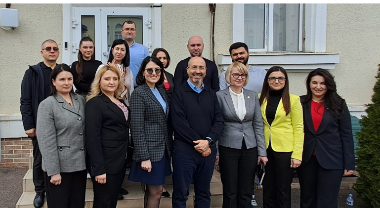
Facilitators from the Internal Protection and Anti-Corruption Service of the Ministry of Internal Affairs, ToT, 13-21 May 2025, Chisinau

In addition to this, to replicate the successful ToT from previous project years, DCAF ran a second generation training-of-trainers on integrity and gender themes in May . This second generation consists of thirteen new facilitators who participated in the first two phases of the ToT from 13-21 May. The two-week course includes a pre-course e-learning phase, one week of training on integrity topics and modern adult learning techniques, and one week of training delivery and debriefing sessions. After completing the 3 phases of the training-of-trainers course, these trainers will become integrity facilitators and will deliver trainings on integrity building, gender mainstreaming, anti-discrimination, and the anti-corruption policies in the MIA's subordinate institutions across Moldova. The third phase of the ToT and the graduation for the second generation of facilitators will occur in the next project period.