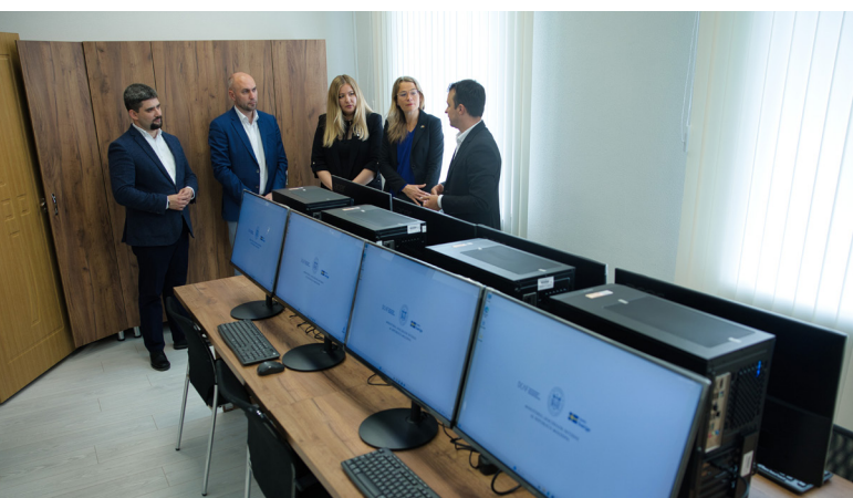
Launch of MIA room for strategic planning and EU accession processes, 28 May 2025, Chisinau

Between March and May, DCAF supported the MIA to equip a room in their central premises designated to strategic planning and EU accession processes. The room will host the Directorate for Public Policy Coordination and European Integration, a reorganised unit tasked with supporting institutional processes related to European accession and responsible for developing and promoting public policy documents in line with national requirements and recommendations presented by the European Commission in the bilateral screening. To make the room functional for this Unit, DCAF donated computers, monitors, printers, laptops, and room furnishings, among other items, to the MIA. The room was officially launched in a ceremony that featured the Deputy Secretary General of the Ministry of Internal Affairs and the Head of Development Cooperation, Deputy Head of Mission, Embassy of Sweden to Moldova on 28 May 2025.