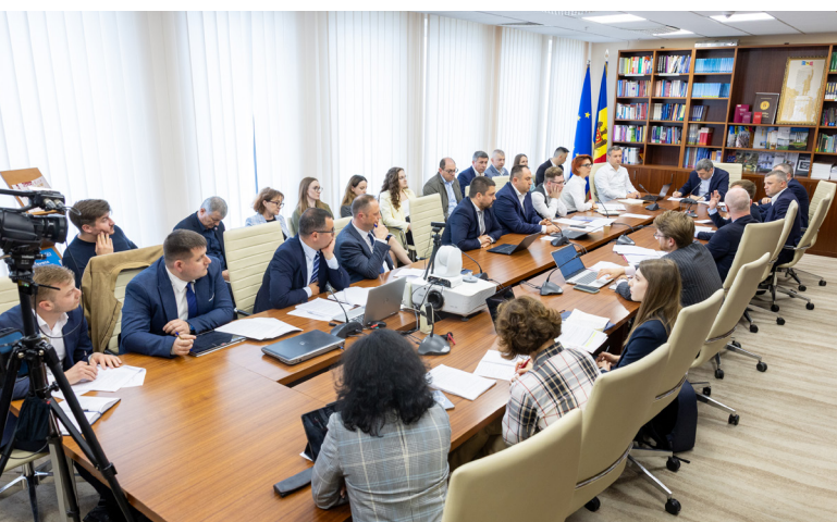
Public consultations on draft law on national security, 7 May 2025, Chisinau

Starting April 2025, the project contributed to the development and review of the draft law on national security , by providing comments and expert advice to both the supreme security council secretariat and to the members of parliament and parliamentary standing committees . In April, DCAF submitted a written expert opinion on the draft law, followed by consultations with the SSC Secretariat in May, until the submission of the law to parliamentary adoption. In June, project team members participated in two public parliamentary debates with the parliamentary committee on national security, as well as multiple informal consultations with members of parliament and parliamentary staff. Consultations will continue into July with the parliamentary working group before the final reading in July 2025.