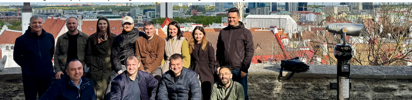
Moldovan delegation study trip on security sector governance and crisis management, 24-31 May 2025, Tallinn, Estonia

Starting April 2025, the project contributed to the development and review of the draft law on national security , by providing comments and expert advice to both the supreme security council secretariat and to the members of parliament and parliamentary standing committees . In April, DCAF submitted a written expert opinion on the draft law, followed by consultations with the SSC Secretariat in May, until the submission of the law to parliamentary adoption. In June, project team members participated in two public parliamentary debates with the parliamentary committee on national security, as well as multiple informal consultations with members of parliament and parliamentary staff. Consultations will continue into July with the parliamentary working group before the final reading in July 2025.