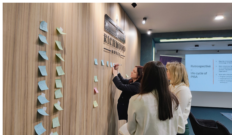
Workshop on institutional development for PISA, 20 February 2025, Chisinau

This semester, the project worked extensively with the Platform for Security and Defense Initiatives (PISA) , building on the partnership and collaborations started in the preceding years.