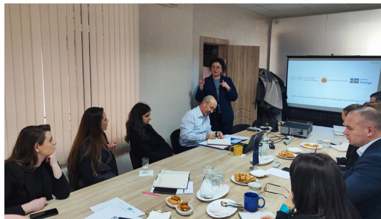
Workshop on project management methodology, 28 January 2025, Chisinau

Between January and March, DCAF ran a series of activities to encourage the development of standard operating procedures on project management in the MIA . On 28 January, DCAF held a workshop for individuals from the MIA that became certified in the project management methodology of the European Commission, PM 2 , as part of the project in 2024. This workshop offered a platform to discuss the next steps for this certified group of individuals. A series of meetings with the same group were held throughout the period, in which DCAF continued the discussion on the development of a standard guide on project management and project management standard operating procedures for the MIA and its subordinate institutions. In March, the MIA held a workshop on the potential for developing standard operating procedures on project management with DCAF's support for all relevant stakeholders. Activities linked to the institutionalisation of project management capacities will continue in the next period.