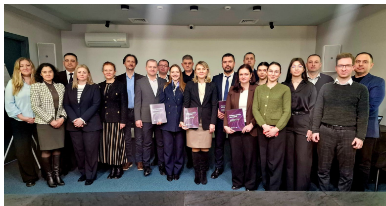
Launch event for the independent report on the information security strategy of Moldova, 29 January 2025, Chisinau

Communications and Information Technology, the Ministry of Internal Affairs, the Prosecutor's Office, the Free International University of Moldova, the Independent Centre for Combating Disinformation, and from the international community.