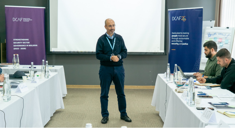
Second generation training-of-trainers sessions on integrity and gender themes, 13-21 May 2025, Chisinau