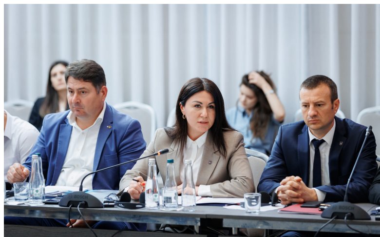
Conference on judicial control in carrying out special investigative and counterintelligence measures, 23 May 2025, Chisinau

Over this semester, DCAF also carried on with the coordination for the development of a judicial benchbook on the authorisation and control of special investigative and counterintelligence measures , which aims to establish clear guidelines for exercising judicial control in criminal proceedings and intelligence activities, while ensuring compliance with standards of the European Court of Human Rights and international good practices. Started at the end of 2024, and following three workshops in June, September, and November last year, during which the working group of authors composed of experts and practitioners from Moldovan courts and prosecution offices involved in the authorisation and monitoring of special investigative measures was formed, and the methodology for the drafting of the benchbook was agreed on, the project organised a fourth in-person workshop on 19 February 2025. The finalisation and publication of the benchbook is planned for the coming year.