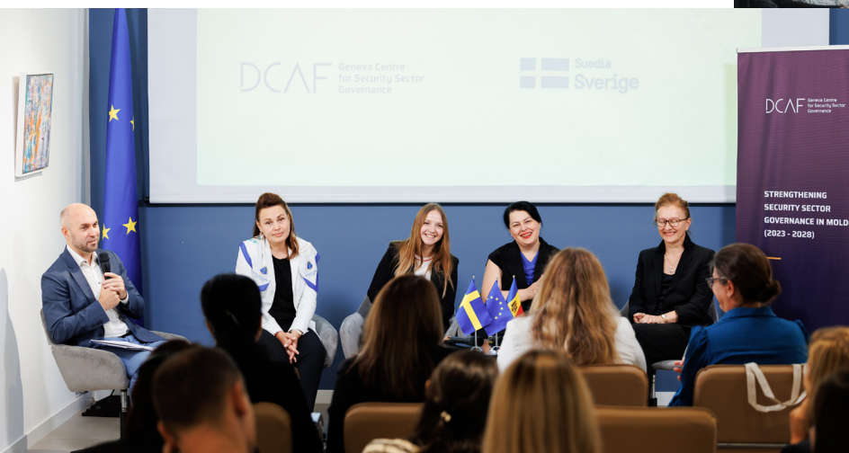
SSGM extension launch event, 12 September 2024, Chisinau.

To celebrate the official extension of DCAF's project until the end of 2028, along with the inclusion of new implementing partners within the project, DCAF organised an extension launch event, on the 12 September 2024 . Hosted at the Europe Café in Chisinau, the small-scale reception served as an opportunity to present the project's new partners and new workstreams to representatives of Moldova's security sector institutions and the international community. A first panel introduced the Swedish Civil Contingencies Agency into the project, and presented the interventions planned with the Ministry of Internal Affairs and the General Inspectorate for Emergency Situations, while a second panel showcased the group of civil society organisations which the project will support through the allocation of sub-grants, namely the Women's Police Association, the Platform for Security and Defense Initiatives, and the Institute for Democracy and Development.