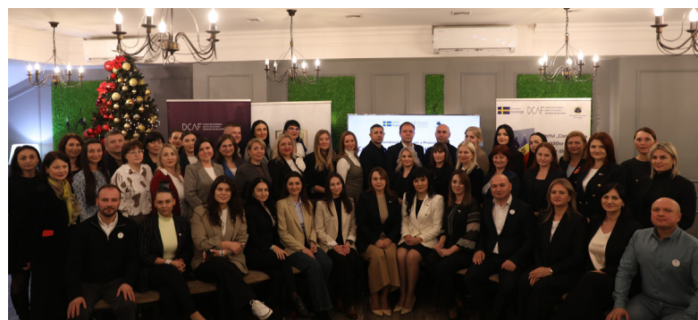
Launch event for the project "Gender mainstreaming and women's networks in the police" by the Women's Police Association, November 2024, Chisinau.

Following the establishment of a partnership with the Women's Police Association this year, DCAF awarded the association a sub-grant based on