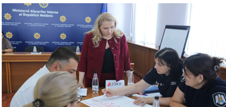
Trainings delivered by integrity facilitators, July 2024, Chisinau.