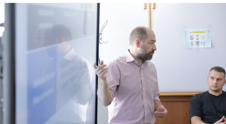
Training on reporting and data collection for the MIA and its subordinate institutions, July-October 2024, Chisinau.

From July to October, DCAF organised a collection of activities to assist the MIA and its subordinate institutions in developing comprehensive, evidence-based reporting on the sectoral programmes of the Strategy for the Development of Home Affairs (SDDAI) . The activities included the development of an evaluation methodology for the SDDAI and its sectoral programmes, trainings on data collection and analysis according to that methodology, workshops on approaches to data presentation for the separate working groups tasked with reporting on each sectoral programme, and feedback on draft reports. This guidance facilitated the reporting process and built capacity for future reporting processes linked to SDDAI, which will be essential for informing strategic planning and management to the end of 2030.