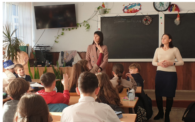
Anti-corruption awareness raising campaign, December 2024, Chisinau.

In recognition of International Anti-corruption Day, taking place on 9 December, DCAF supported the Internal Protection and Anti-Corruption Service (SPIA) of the MIA to raise public awareness of their function and activities . SPIA visited schools to spark discussions about corruption and integrity and to distribute promotional material about their mandate and organised a friendly football competition for its second consecutive year entitled the “Integrity Cup”. This support, coupled with other activities implemented under Outcome 2, aims at comprehensive integrity building in the MIA by complementing internal capacity building with external awareness raising and efforts towards reinforcing integrity as a cultural value.