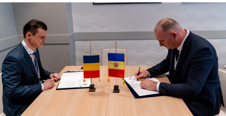
Regional exchange between representatives from SPIA and their Romanian counterparts, 26-27 November 2024, Bucharest.

DCAF sponsored the participation of two representatives from the Internal Protection and Anti-corruption Service (SPIA) in the ‘Together for Integrity’ conference organised by the European Partners Against Corruption (EPAC) network and held in Bucharest, Romania from 26 to 27 November . This conference gathered representatives from justice and security sector institutions and international organisations across Europe to exchange on a multitude of anti-corruption topics, including investigating and prosecuting corruption and fraud, mechanisms for preventing corruption in law enforcement, and institutional culture, awareness-raising and integrity training in the police.