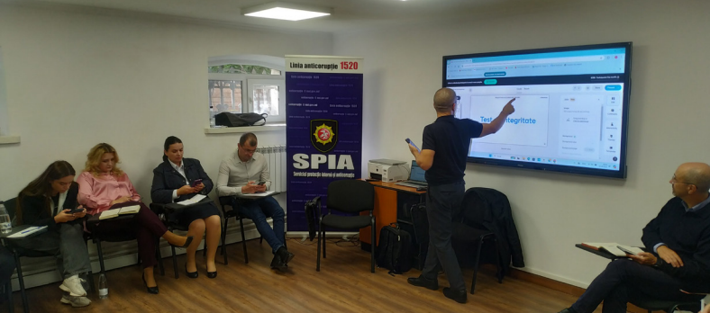
Trainings delivered by integrity facilitators, October 2024, Chisinau.