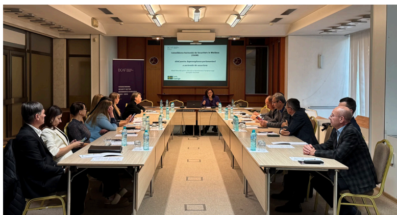
Parliamentary Roundtable for the development of a Guideline on Parliamentary Oversight of the Security Sector, 5 November 2024, Chisinau.

Expanding on the 2023 contribution of the project in the development and adoption of the laws regulating the activity of the Security and Intelligence Service (SIS), DCAF provided insights to the defense committee into different European approaches in setting up intelligence oversight committees. This work contributed directly to the formulation of amendments to the Parliament's Rules of Procedure, whose approval is pending.