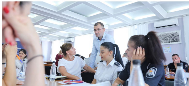
Trainings delivered by integrity facilitators, July 2024, Chisinau.

implement the methods introduced in workshops with DCAF in practice and reinforce the work of MIA's Internal Protection and Anti-corruption Service (SPIA).