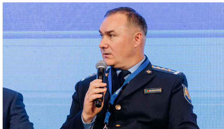
Moldova Security Forum, “Crisis Management as a Key Element for Building Resilience” panel, 20 November 2024, Chisinau.

DCAF organised one session entitled “Crisis Management as a Key Element for Building Resilience” that took place on 20 November. With panel contributions from DCAF, the General Inspectorate for Emergency Situations of Moldova, the Inspectorate for Operational Management of Moldova, the Directorate-General for European Civil Protection and Humanitarian Aid Operations, the Tony Blair Institute, and the Platform for Security and Defense Initiatives, the session covered topics such as the integration of Moldova into the EU civil protection mechanism, democratic governance in crisis management, capacity building for effective crisis management, and building resilience through regional cooperation.