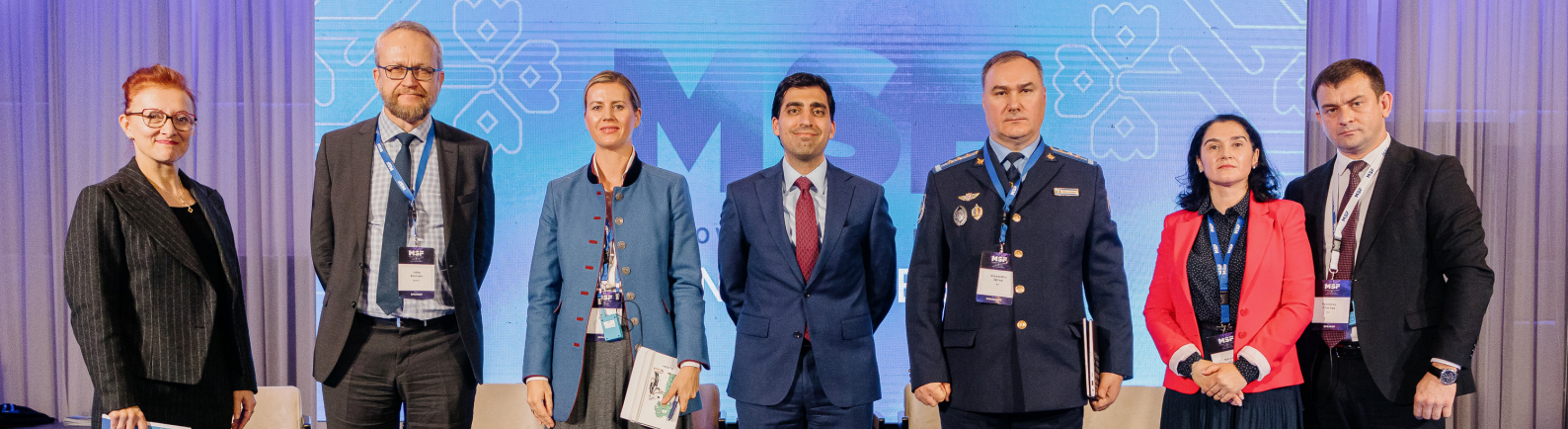
Moldova Security Forum, "Crisis Management as a Key Element for Building Resilience" panel, 20 November 2024, Chisinau.