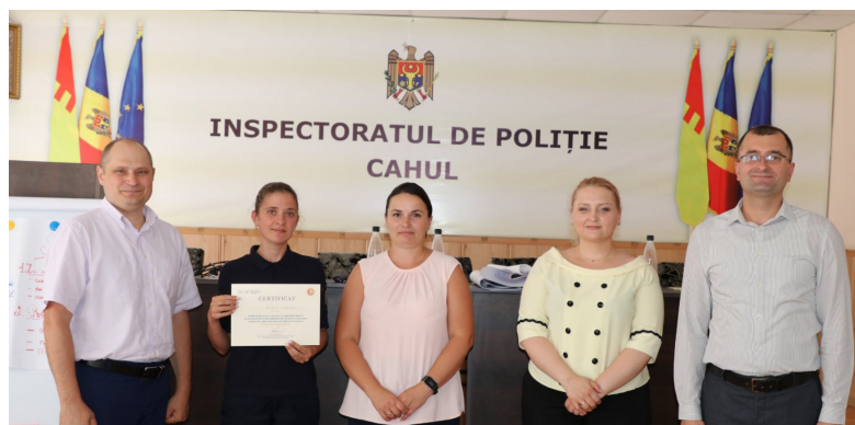
Trainings delivered by integrity facilitators, July 2024, Chisinau.