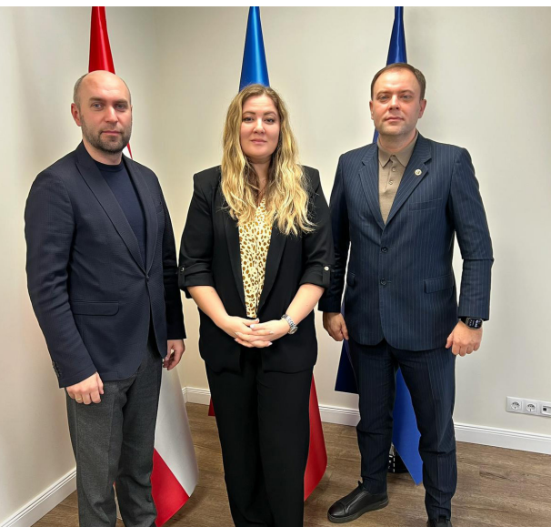
Donation of new equipment to the General Police Inspectorate, December 2024, Chisinau.

Equipping this unit with two desktop computers will enable increased efficiency in their work in terms of information analysis and data comparison. A similar donation of equipment will occur for the central apparatus of the MIA in first quarter of 2025.