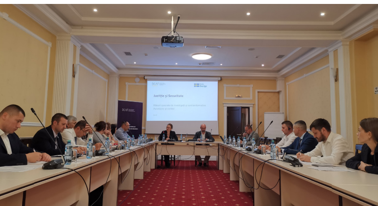
Judicial Roundtable on the alignment of Moldovan judicial practices to European standards, 10 September 2024, Chisinau.

In parallel with the development of a guideline for Parliament, DCAF initiated a similar process with a group of judges and prosecutors from various courts and judicial institutions in Moldova. In cooperation with the National Institute of Justice, the Superior Council of Magistracy, and the Superior Council of Prosecutors of Moldova, DCAF organised two roundtables on the 10 September and 6 November 2024 to discuss aligning Moldovan judiciary practices with European standards , following an initial event that took place in June. The roundtables featured contributions by experts from North Macedonia and, in addition to covering the alignment of national legislation and practice with European standards, offered space to discuss the new responsibilities of the Moldovan judiciary, in the authorisation and review of the use of special investigative and counterintelligence measures by the intelligence services. The roundtables brought together practicing judges and prosecutors to form a dedicated working group that will develop a Judicial Benchbook on the authorisation and control of special investigative and counterintelligence measures . This initiative aims to inform the development of judicial practice, clarify procedures, and support the judiciary in safeguarding fundamental human rights, including the right to privacy and the right to a fair trial.