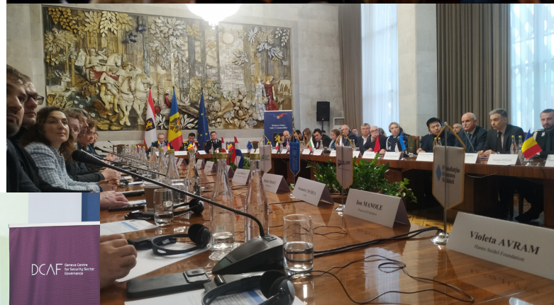
Police Day, 18 December 2024, Chisinau.