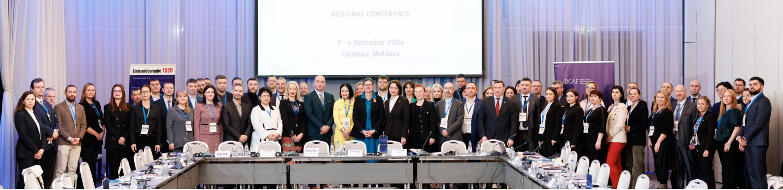
Regional Anti-Corruption Conference “Building Integrity from Within: Strengthening Internal Control for a Corruption-Free Future”, 3-4 December 2024, Chisinau.