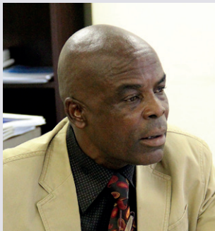
Lieutenant Colonel Bassie Bangidza, Centre for Defence Studies, Zimbabwe

Lieutenant Colonel Bangidza stated that women were also involved in the freedom struggle in Zimbabwe and now occupied high-level positions in politics, the judiciary and the police. He described how the Centre offers a BA, MA and PhD in War and Strategic Studies as well as a programme on Peace and Security Studies. Though gender issues are mentioned in the curriculum, they are not overt.