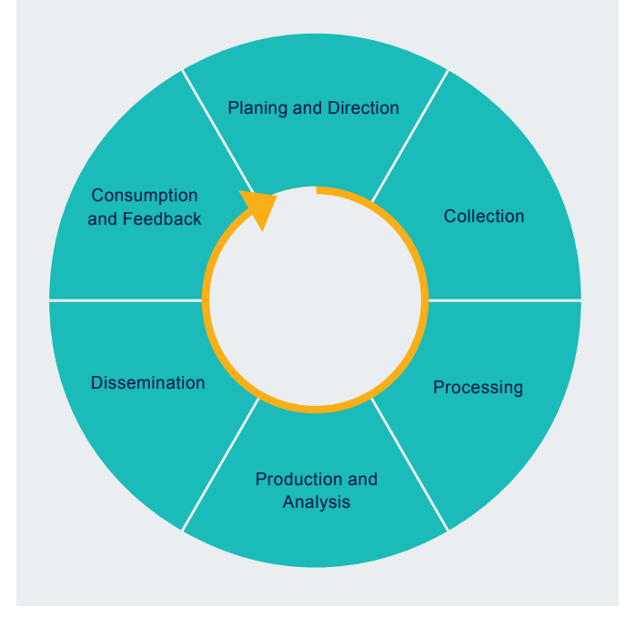
FIGURE 2 THE INTELLIGENCE CYCLE

Consumption and feedback is when political decisionmakers use intelligence products to make decisions. Feedback to the intelligence community includes guidance on future intelligence needs, which feeds into planning and direction, launching the cycle again.