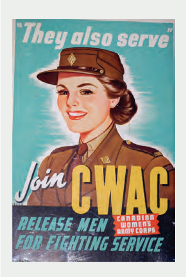
Box 6.1 Women in the Canadian military<sup>10</sup>

Portraying women in combat roles (see modern poster, right) can plant the idea of serving in this function in the minds of recruits, and also normalize the notion of female armed combatants for men in the army in general. Previously (see poster from 1940s–1960s, left), the armed forces sought to promote the acceptance of women in the military for a different logic, and hence few women or men would have imagined a combat role for women at the time.