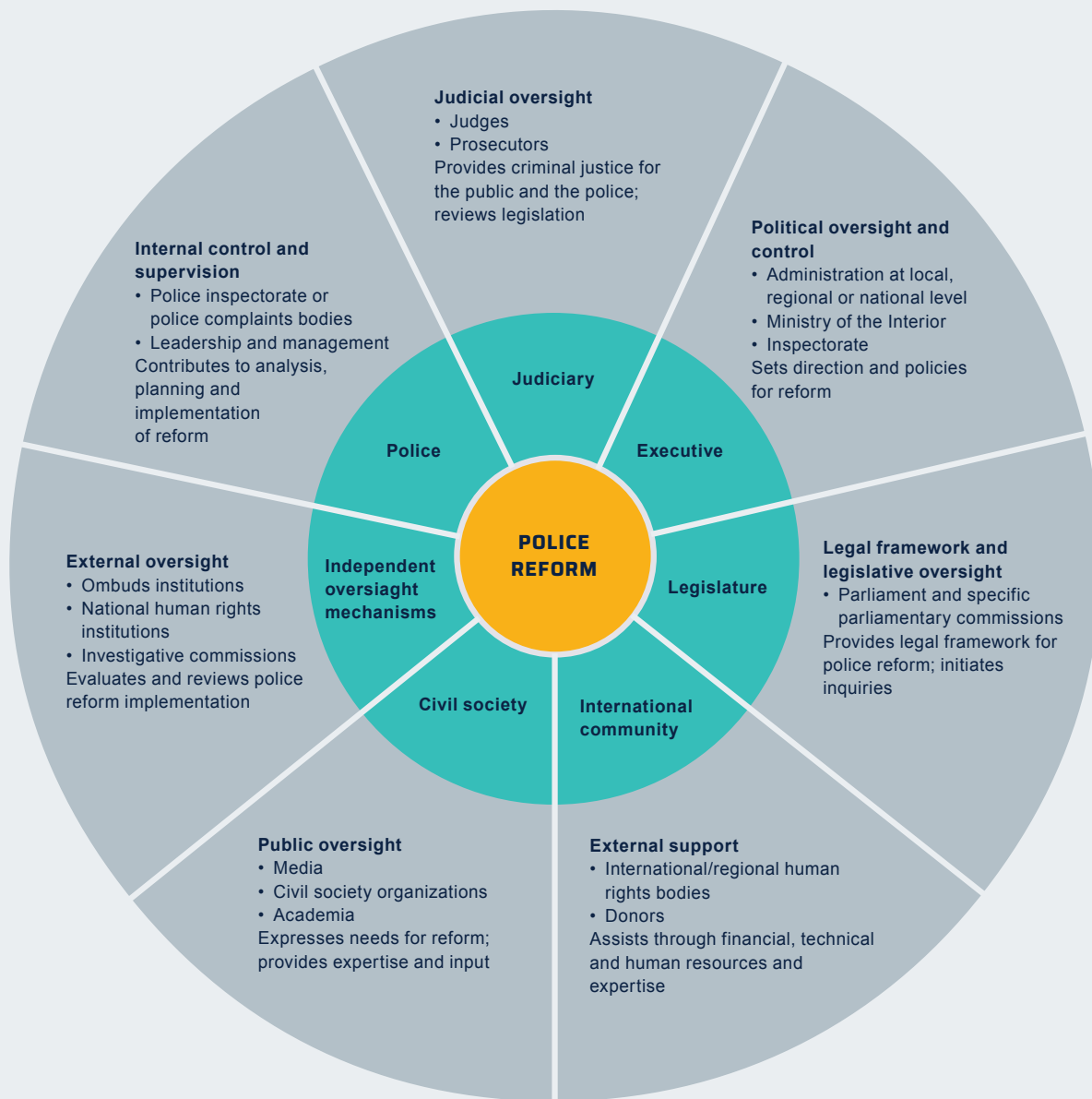
FIGURE 1 POLICE REFORM INVOLVES A VARIETY OF STATE AND NON-STATE ACTORS